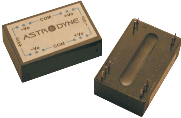
Unit measures 0.8"W x 1.25"L x 0.4"H