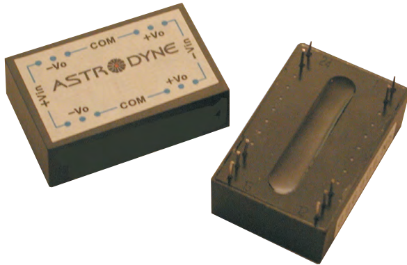
Unit measures 0.8"W x 1.25"L x 0.4"H