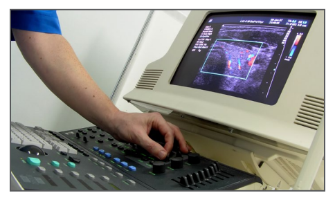
Portable Ultrasound Equipment