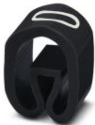
Conductor marking collar, Labeled with the number: Numbers, black, width: 4.2 mm

Please be informed that the data shown in this PDF Document is generated from our Online Catalog. Please find the complete data in the user's documentation. Our General Terms of Use for Downloads are valid ( http://phoenixcontact.com/download )