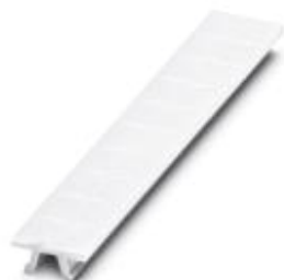
Zack marker strip, 10-section, vertically labeled with the consecutive numbers: 171 ... 180, white, width: 6 mm

Please be informed that the data shown in this PDF Document is generated from our Online Catalog. Please find the complete data in the user's documentation. Our General Terms of Use for Downloads are valid ( http://phoenixcontact.com/download )