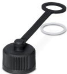
M12 sealing cap made of plastic with fixing band, for free M12 plugs with 12.0 mm fastening eye

Please be informed that the data shown in this PDF Document is generated from our Online Catalog. Please find the complete data in the user's documentation. Our General Terms of Use for Downloads are valid ( http://phoenixcontact.com/download )