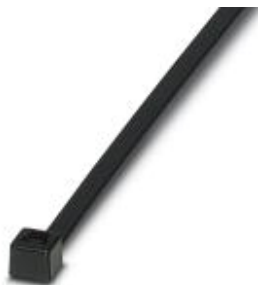
Cable binders for quick and secure bundling, standard version

Please be informed that the data shown in this PDF Document is generated from our Online Catalog. Please find the complete data in the user's documentation. Our General Terms of Use for Downloads are valid ( http://phoenixcontact.com/download )